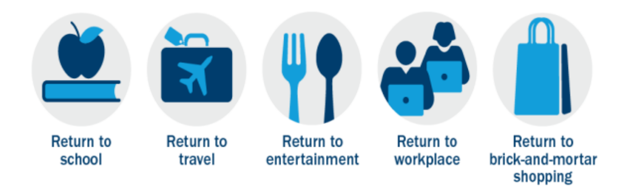
Figure 2: Tracking inputs

Overall, our index suggests that we're still 14% below pre-Covid activity levels, but some components of our index have already returned to normal levels. Activity for bricks-and-mortar spending and return to school are now into our normal range — spending gains are driven by pent-up demand, and school data has shown that there are plans for in-person schooling. Both numbers may fluctuate — spending may fall a bit as demand normalises; in-person schooling may fall if US districts change their plans in response to infection and hospitalisation rates. Activity numbers for some index components won't return to where they were before Covid. Some changes in behaviour, such as working from home, are likely to stay with us for an extended period and because of this, activities such as business travel might take longer to reach the 90% threshold or pre-Covid levels.