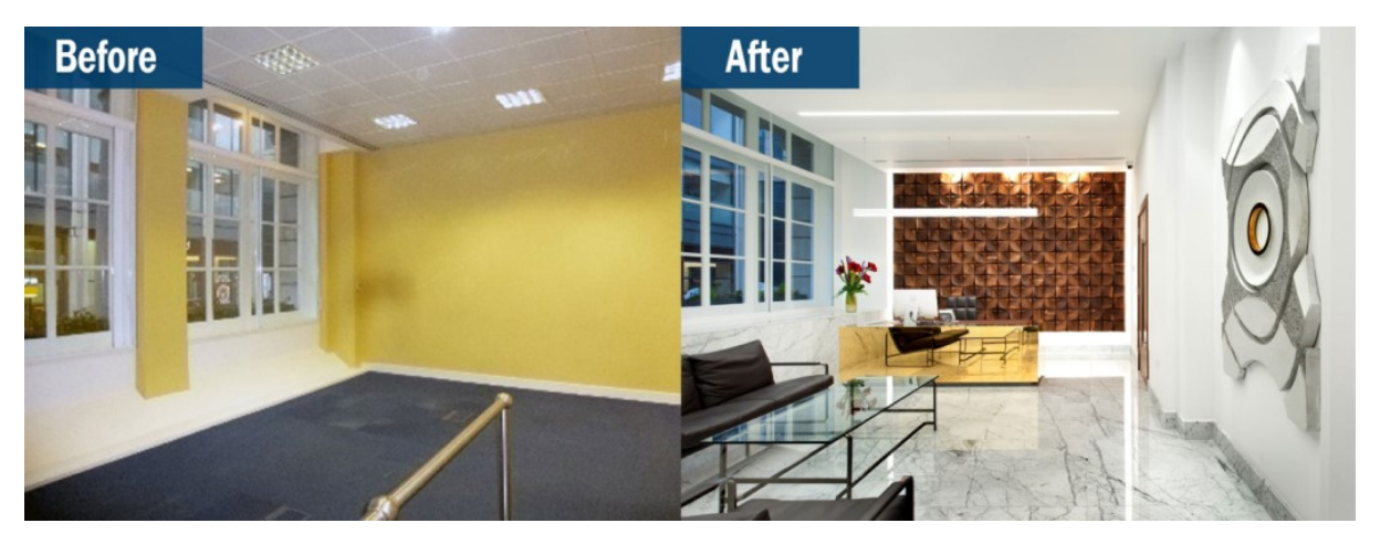
Our refurbishments can modernise properties and deliver more attractive and sustainable workplaces for our tenants. Above is the reception area of an East Central London office building, before and after a refurbishment project managed by Columbia Threadneedle. For illustrative purposes only.

The risks if we do not collaborate are serious: the value of low-performing real estate assets will suffer as demand for them declines and new regulation threatens to make them obsolete. However, if we can plot an effective route to carbon neutrality we will protect and enhance their value. Our refurbishments will modernise them, delivering more attractive and sustainable workplaces with lower running costs that comply with the toughest environmental standards. This will help our tenants and investors to improve their own ESG performance, delivering wider benefits to society. For investors, our approach should translate into higher occupancy, fewer voids, higher rents and enhanced capital values.