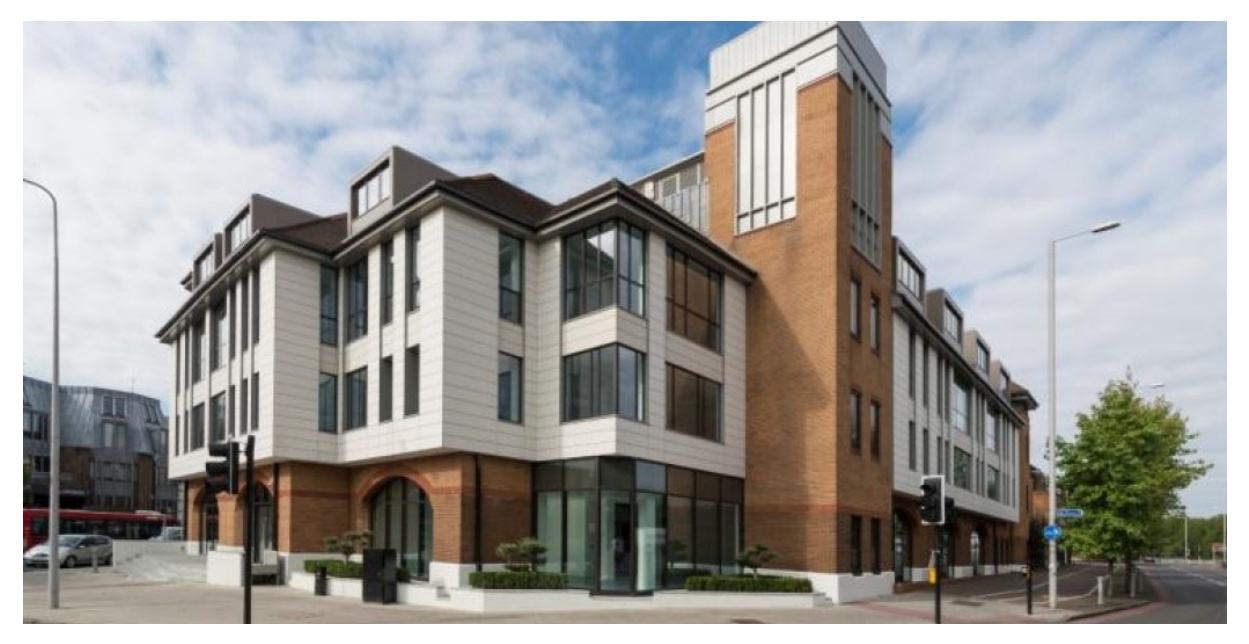
Following our refurbishments which included an upgraded façade, full M&E replacement and car parking spaces removed in favour of cycle bays, this building in Richmond London fetched an ungeared IRR of close to 52.4% over a period of 16 months<sup>4</sup>. For illustrative purposes only.

We have also been working with Stanhope, a leader in sustainable development techniques, to reduce carbon emitted during the construction phase. Stanhope played a key role in the creation of the Building Research Establishment Environmental Assessment Method (BREEAM) accreditation system in the 1990s and is founding partner of the UK Green Building Council. Wherever possible, our refurbishments use recycled and sustainable materials such as carbon-negative carpet tiles and airlite paint.