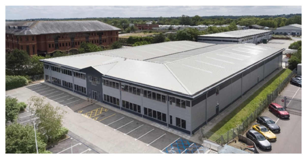
New double-glazed rooflights, LED lightings and EV charging points are just some of the few upgrades that we installed at this warehouse, achieving a capital value uplift of more than 46%. For illustrative purposes only.

Overall, our refurbishments to date have all achieved BREEAM "Excellent" ratings along with an average improvement in EPC ratings from E to B. Once occupied, their energy intensity is 24% lower than the typical 2019 level calculated by the UK's Better Buildings Partnership.